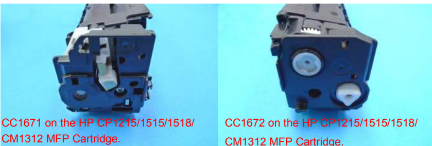
CC1671 on the HP CP1215/1515/1518/CM1312 MFP Cartridge.

Step 1. Remanufacturing the OEM HPCP1215/1515/1518/CM1312MFP Cartridge as normal standard procedure.