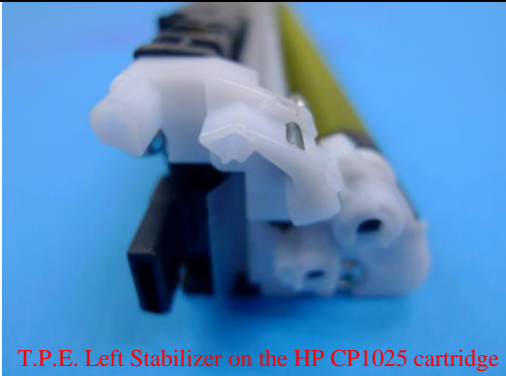
T.P.E. Left Stabilizer on the HP CP1025 cartridge

Cutting away this strip has probably opened up the joint line of the hopper. Therefore it is essential to apply some polystyrene glue or solvent on the cut section to reseal the hopper as shown in the photo, to prevent toner leakage.