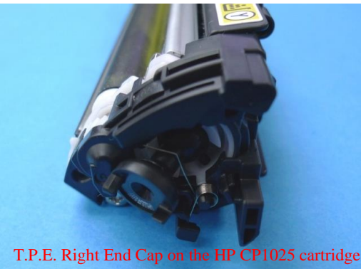
T.P.E. Right End Cap on the HP CP1025 cartridge